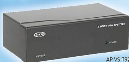
AP VS-T92B : Front