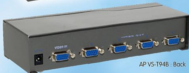
AP VS-T94B : Back