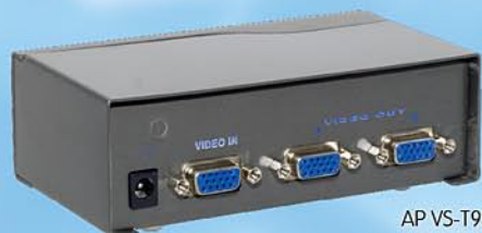
AP VS-T92B : Back